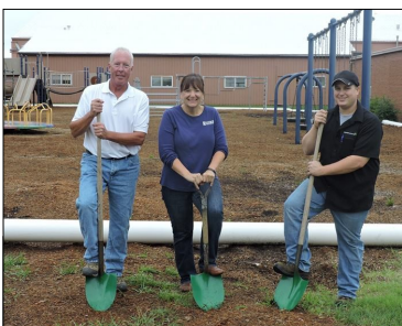
funded by the Larry Wedel Health Fund.

Outreach McPherson, $2,500: A project to provide twin and queen sized mattresses to families that can't afford beds. Grant