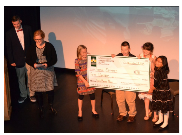
A grant of $50 was awarded to McPherson Special Olympics on behalf of the fund raising efforts by the Eisenhower Elementary Super Morphing Ninjas.

The Philanthropist of the Year award was established in 2008 by the Community Foundation. It was